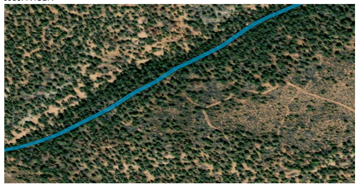
Terrain and Soil: Pinon-Bowdish-Rock outcrop complex, 3 to 30 percent slopes good for limited farming.

Wetlands: Seasonal Riverine System through the property. Seasonally flooded – Classification code: R4SBA